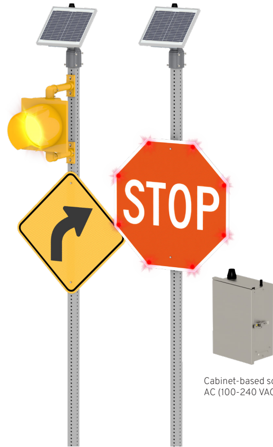
Cabinet-based solar and AC (100-240 VAC) available